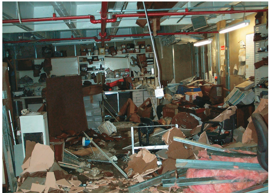
This maintenance office, located in a below-grade area, was completely submerged. Valuable maintenance records, service agreements and other articles were lost.

A spice manufacturing facility experienced two almost identical flood losses one year apart. The second time around, storage of finished products had been relocated to a height above the previous flood levels. Also, employees took their laptop computers home and were able to conduct vital business transactions from there. These steps resulted in the second flood loss being less than 50% of the first, a savings of US$1 million.